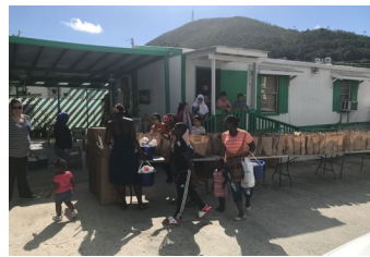
Muslim youth distributing care packages at Masjid Nur Ahl-Ul-Sunnah, St. Thomas, USVI.

One, Schumacher Electronics, Paradise Covenant Ministries, and Community Action Now whom sent aid which included, water, nonperishable foods,